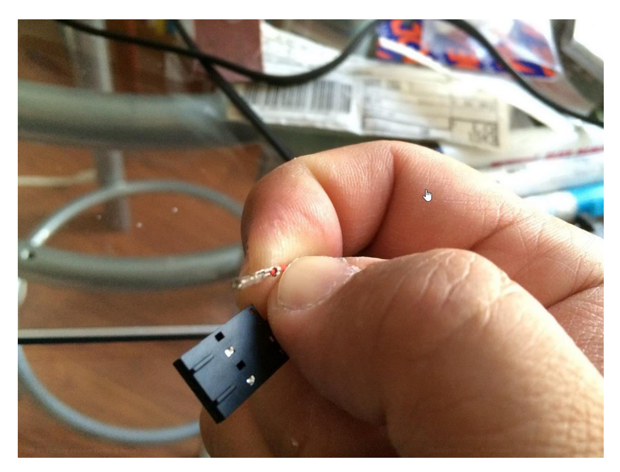
This is the end of the wire that will slide over the original battery lead on the logic board